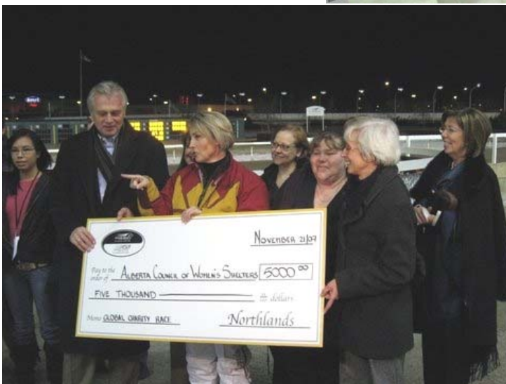
ACWS receiving a cheque in the Winner's Circle