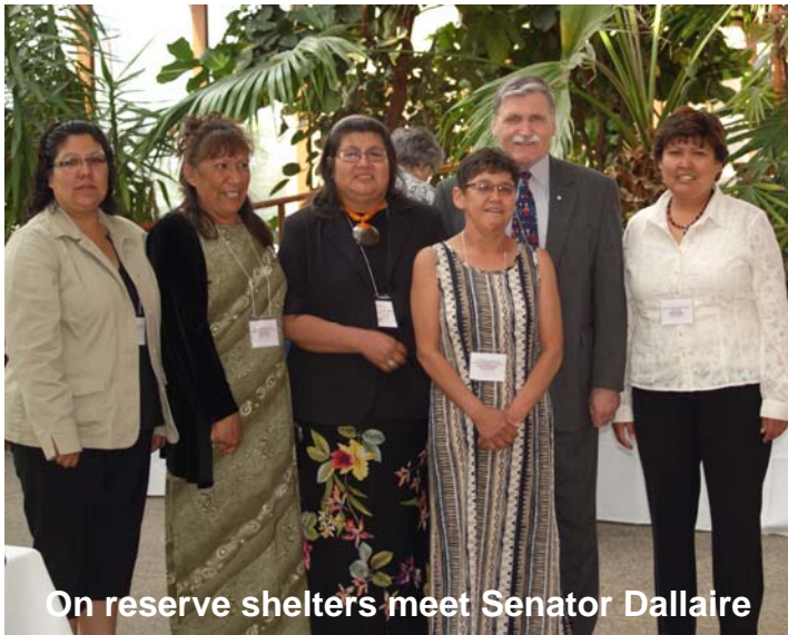
On reserve shelters meet Senator Dallaire