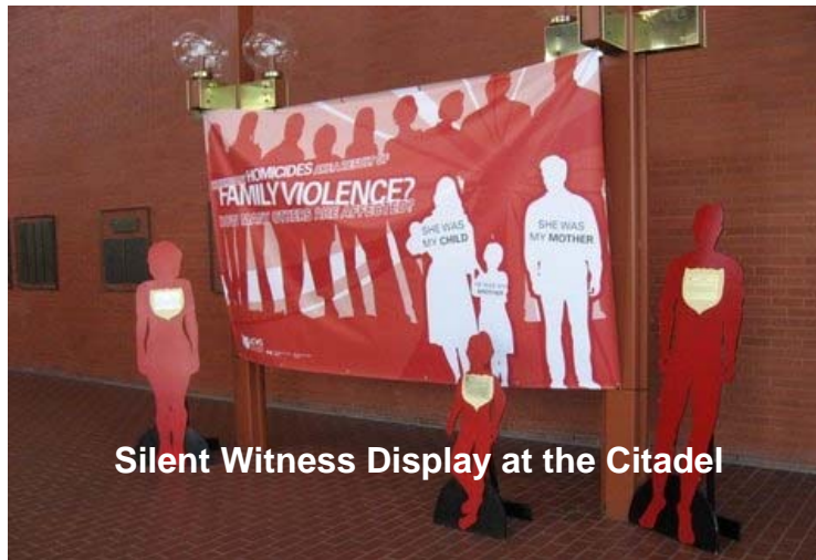
Silent Witness Display at the Citadel

The Social and Legal Ethics Committee met once to undertake an ethical review of the research project: Danger Assessment Utilization in Alberta. This committee recommended approval of this project to the Board and offered some thoughtful advice to the research team.