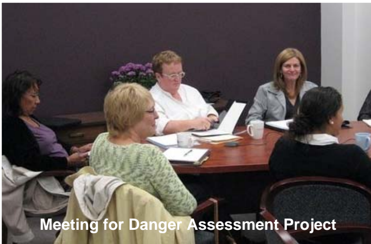
Meeting for Danger Assessment Project